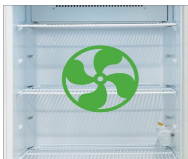
Intelligent Fan Management

These slide out drawers include dividers to allow contents to be easily organised and separated by patient